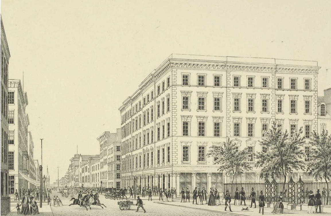
FIG. 1 Broadway from Chambers St., looking north, ca. 1850. Lithograph. Eno Collection, Miriam and Ira D. Wallach Division of Art, Prints and Photographs, The New York Public Library, Astor, Lenox and Tilden Foundations.

On September 26, 1846, an advertisement in the New York Herald touted a new space for “Fashionable Shopping in New York,” Irish entrepreneur A. T. Stewart’s freshly completed dry goods emporium at 280 Broadway. Built on the “unfashionable” east side of Broadway, Stewart’s Italianate “Marble Palace” became a household name and landmark within just four years, frequently cited in ladies’ journals and newspapers. In an 1850 lithograph depicting Broadway from Chambers Street (FIG. 1), the Marble Palace dominates the streetscape in its scale, yet its incorporation