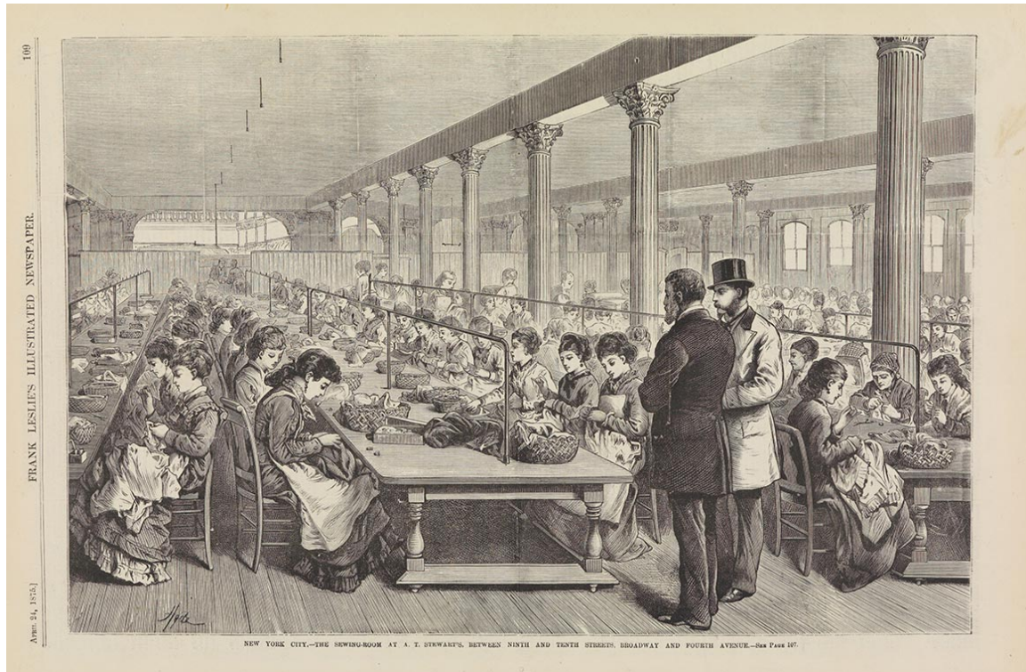
FIG. 4 “The Sewing Room at A.T. Stewart’s.” From Frank Leslie’s Illustrated Newspaper, April 24, 1875.